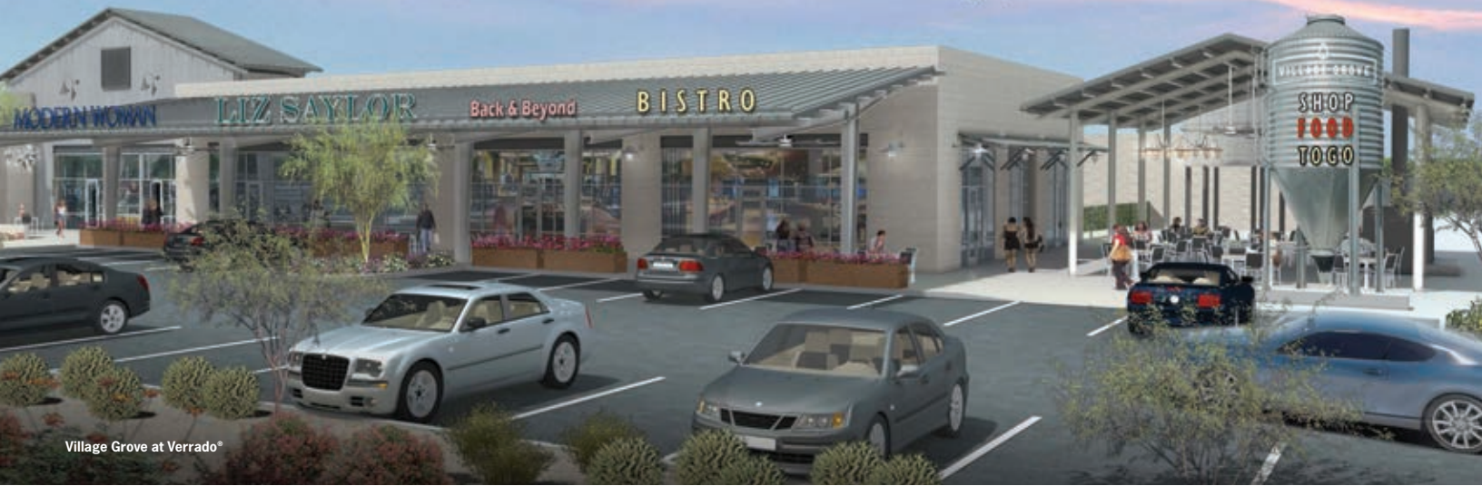
Village Grove at Verrado®