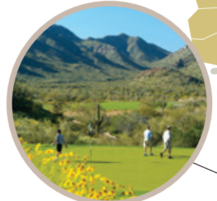
Verrado Golf Club Verrado Grille