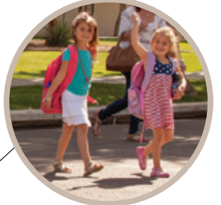
Verrado Middle and Elementary Schools