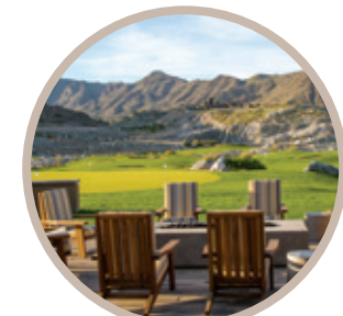
The Big Patio