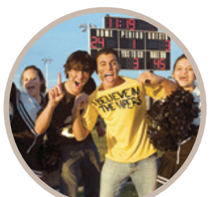
Verrado High School