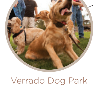
Verrado Dog Park