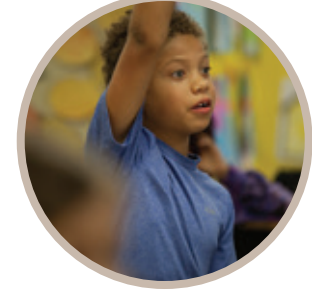
Verrado Heritage Elementary School