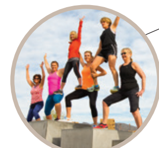
Victory Trail Head