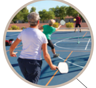
The Center on Main