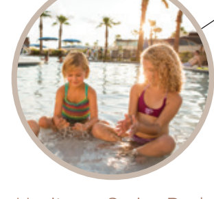
Heritage Swim Park