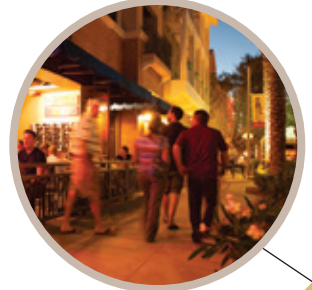
Main Street Verrado